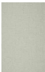
STELVIO - 201 - LUSO